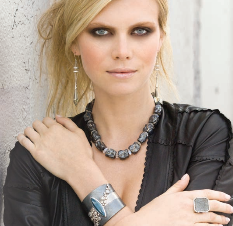
Sapphire ring by Schmitt Jewelers, Zultanite earrings by Zultanite Gems, LLC and Aqamarine cuff by Todd Reed, Inc.