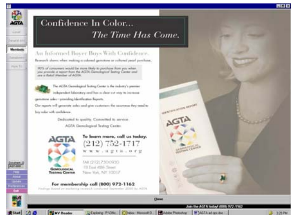
Search Page Ad, opens to Full Page Ad