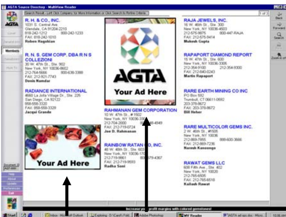
¼ Column and ½ Column Ads