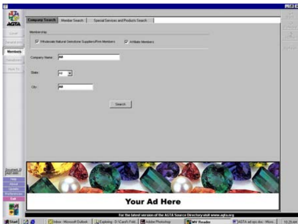
Search Page Ads (3 available)

Spotlight your business with an ad in the Electronic Source Directory. There are an array of ad styles and positions.